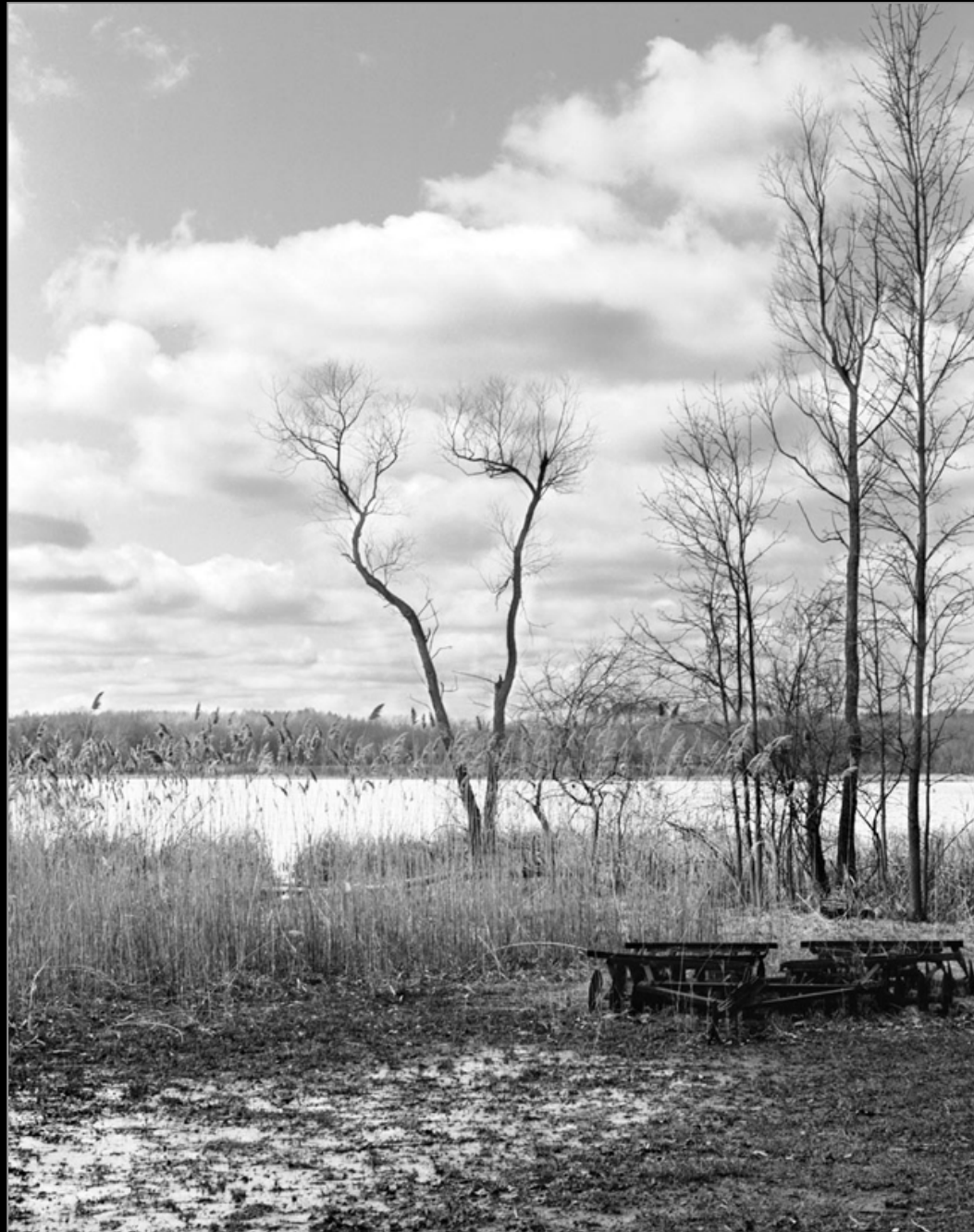
Ariana Gomez, Photo 6, Final Project, Inkjet print