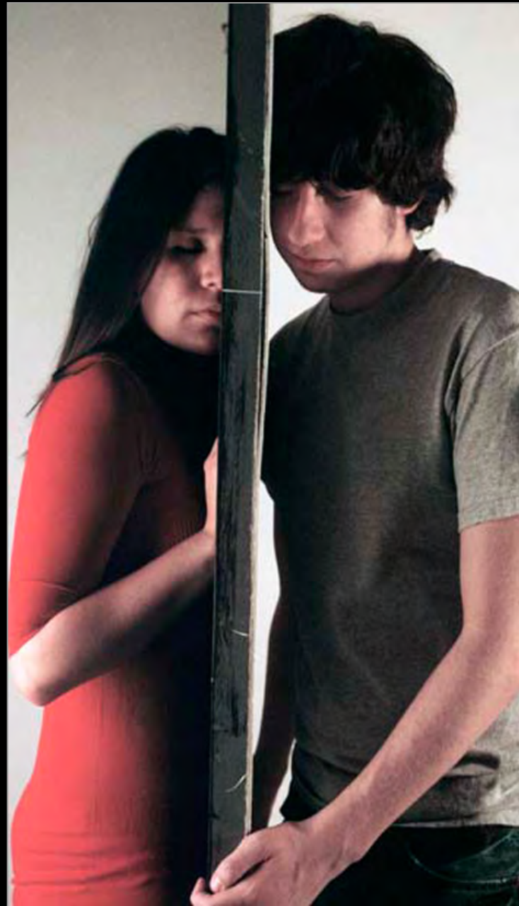
Andrea Dudla, Photo 2, Narrative, Inkjet print