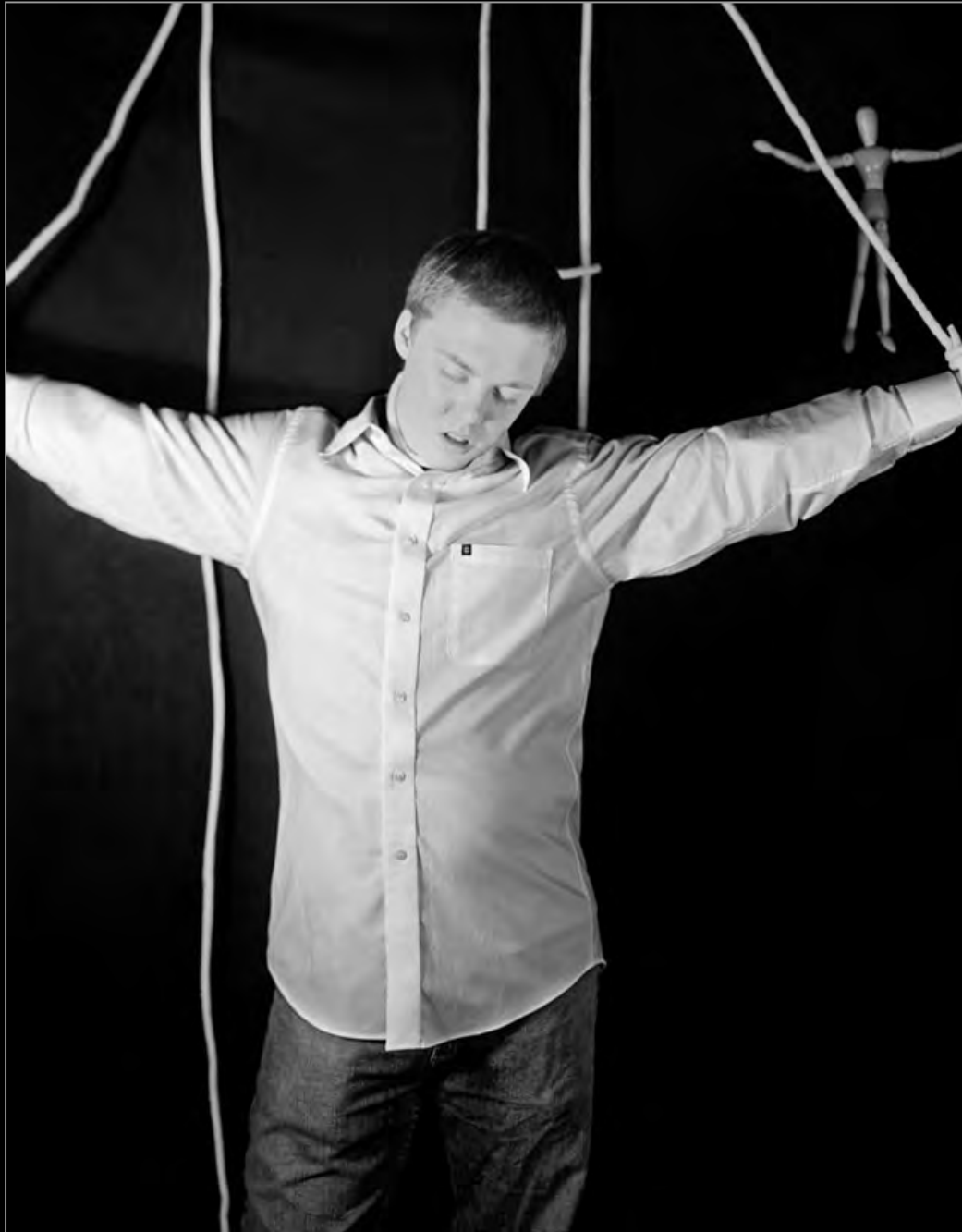
Ben Cort, Photo 2, Large Format/Studio, Inkjet print