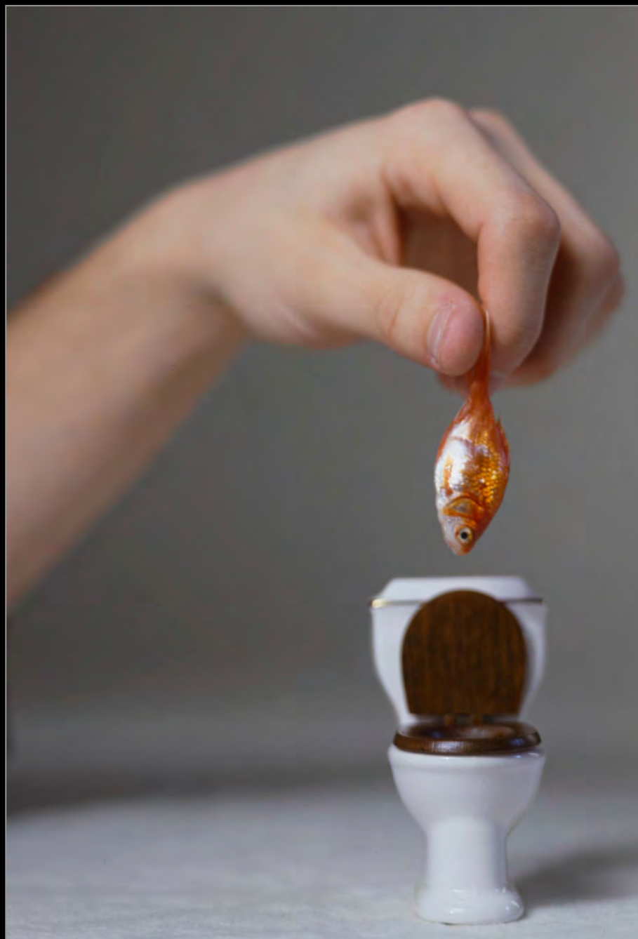
Sarah Mooney, Photo 2, Large Format/Studio, Inkjet print