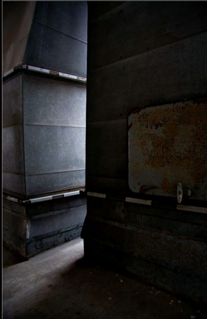
George Delany, Photo 1, Quality of Light, digital image