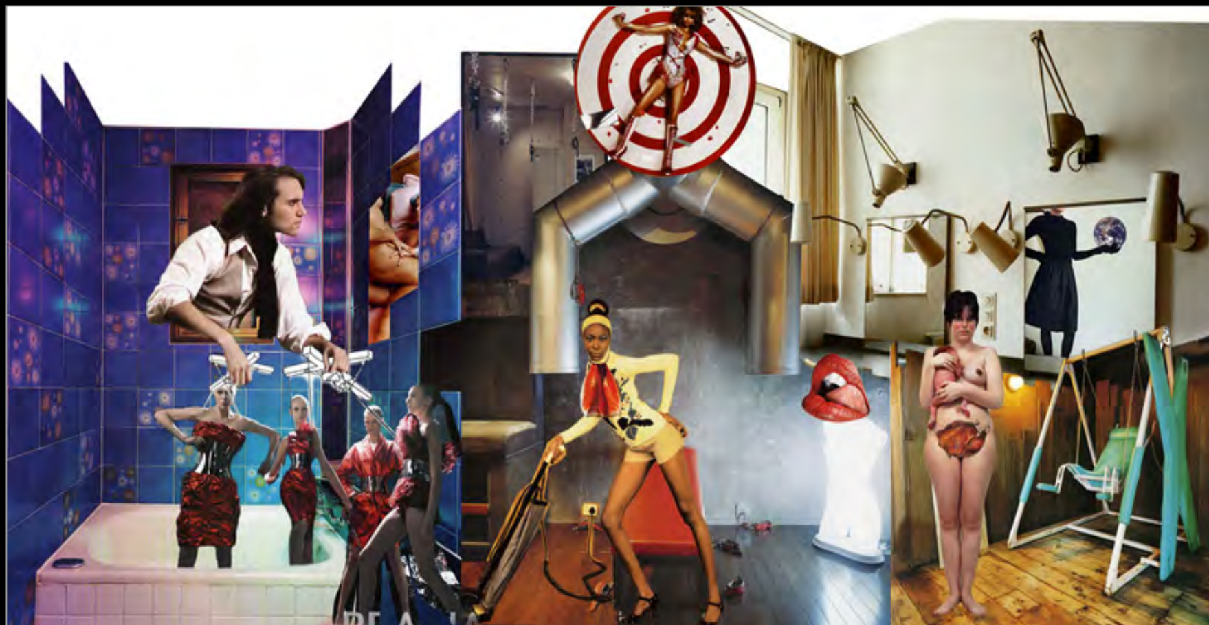
Cassandra Ficcardi, Digital Imaging for Fine Artists, Fantasy Landscape, Inkjet print